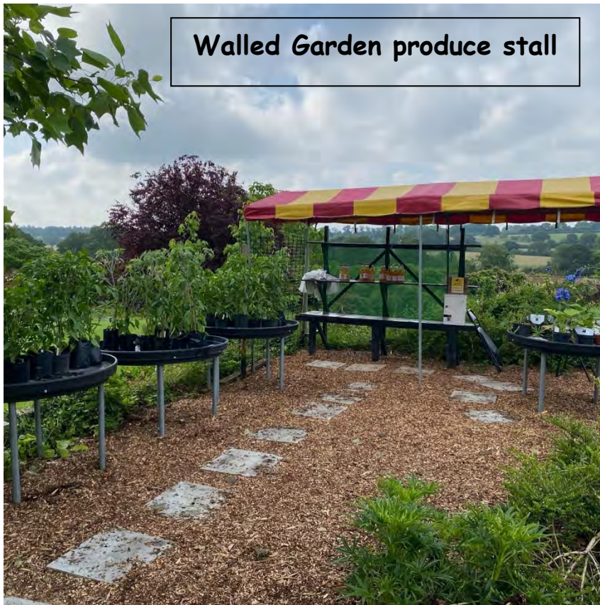
Walled Garden produce stall

Our produce stall was a great success this year selling many unusual varieties of chilli plants, perennial garden plants and apple juice.